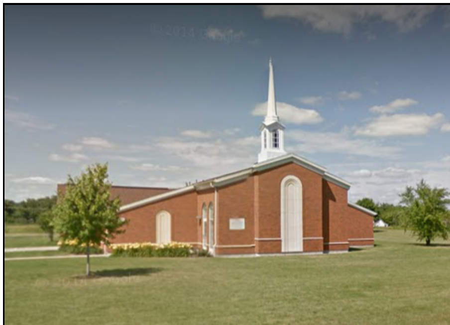
Waseca Minnesota building