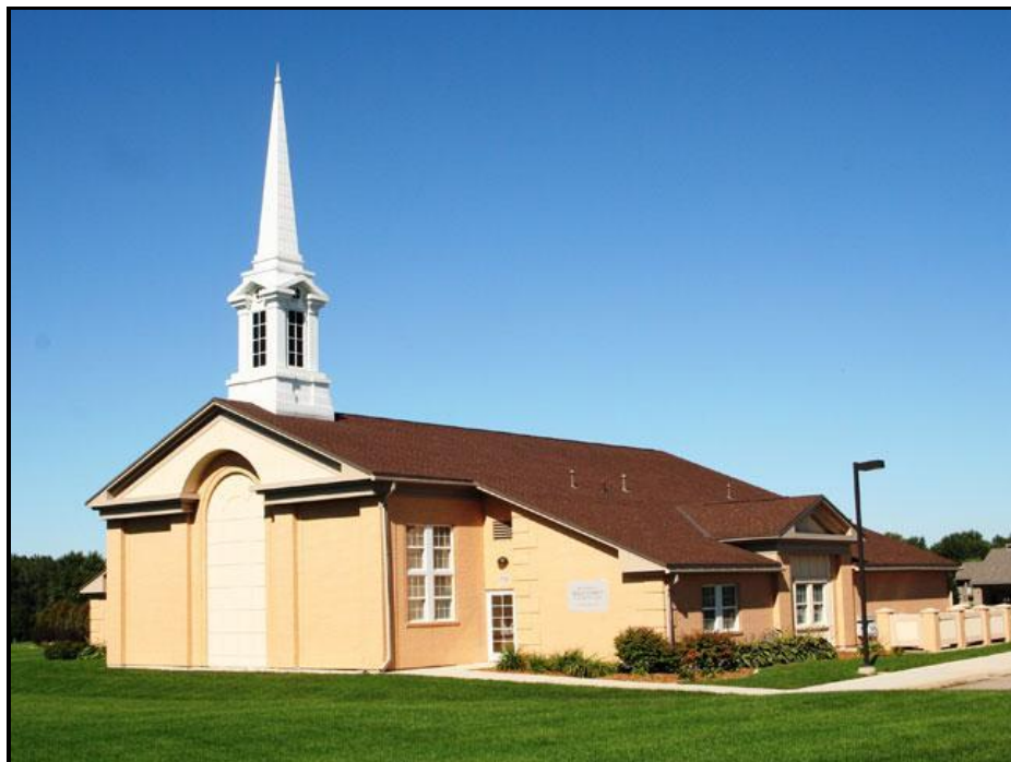
Albert Lea Minnesota Branch Building