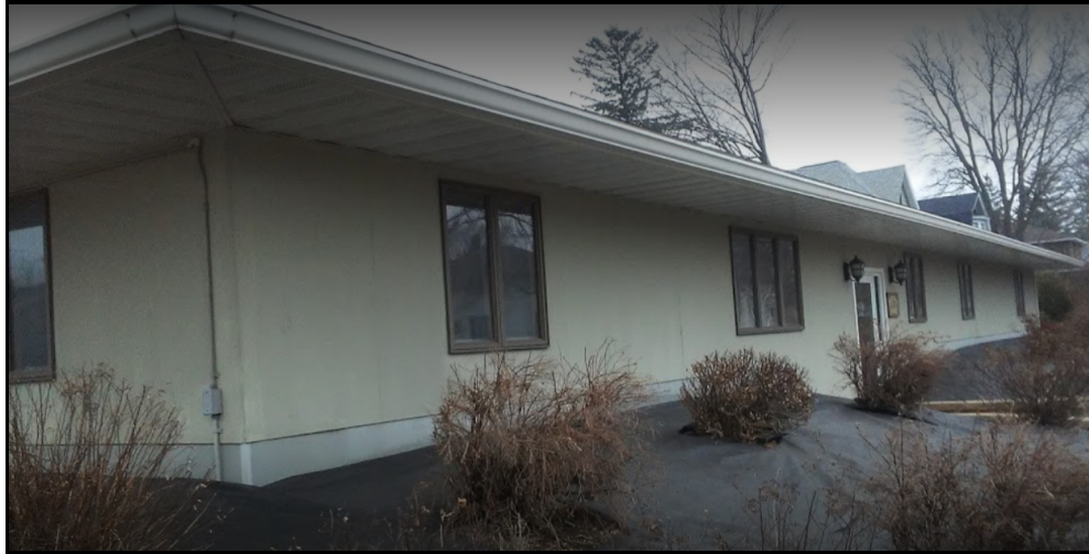
Front of Viroqua Wisconsin Branch meetinghouse