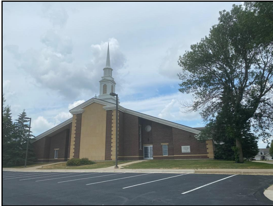
2021, the Rochester Minnesota Stake building at 2300 Viola Heights Drive

Minnesota Stake be formed was made known.