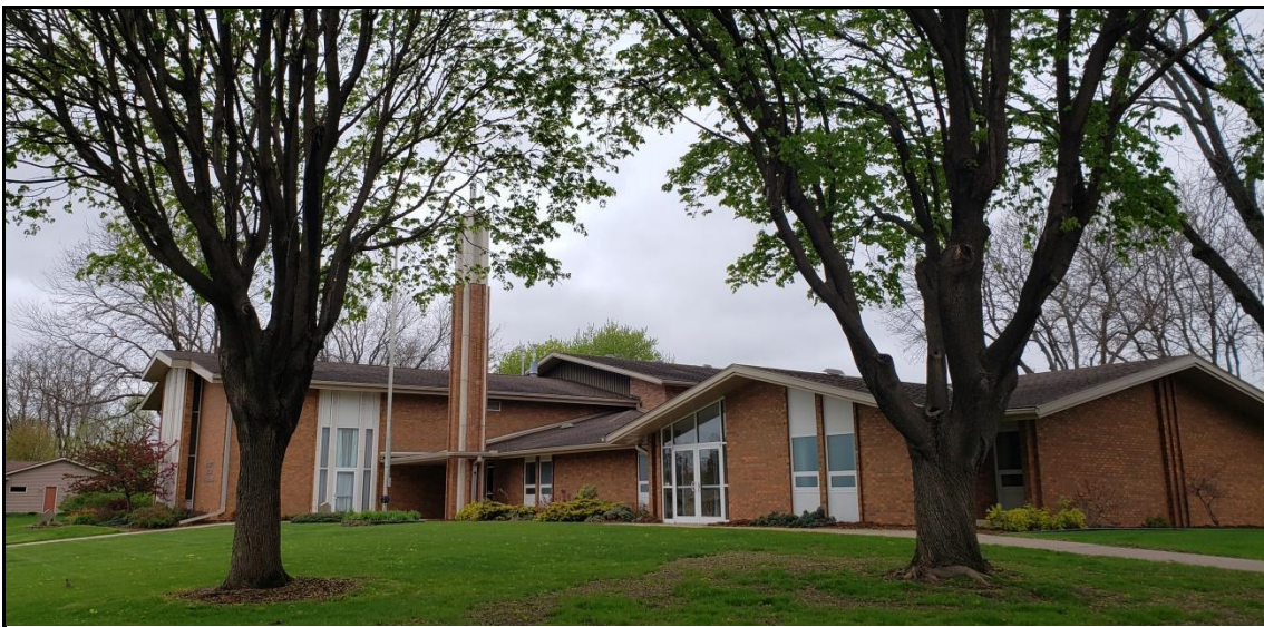
The La Crosse Wisconsin Ward building