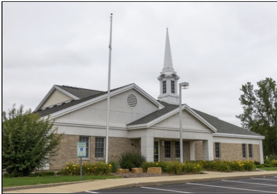
Sparta Wisconsin Branch building