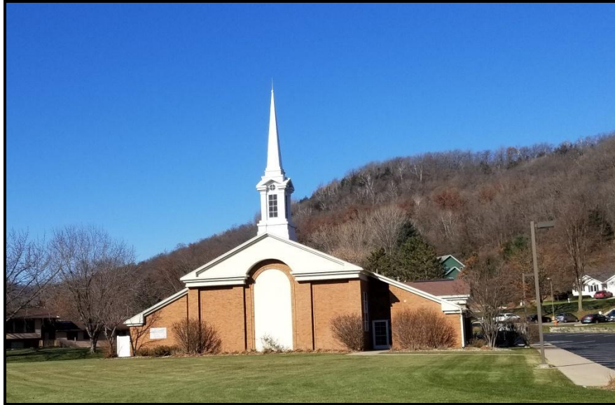
Winona Minnesota Branch building