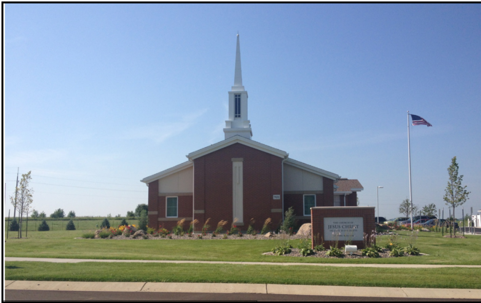
Kasson Minnesota Branch building

daughters who have been prepared to receive the restored Gospel in its fullness. Bless the messengers of eternal truth who go out into the world from this Kasson Branch that their testimonies may be certain and unwavering, that they may be led to those who will accept the truths of the eternal Gospel. We thank Thee for the nation and state in which this Chapel stands. We thank Thee for the privilege of worshipping Thee according to the dictates of our conscience, and pray that we may forever enjoy the great blessings of freedom of assembly, freedom of speech, and freedom of worship. With gratitude and with a spirit of prayer in our hearts, we offer our thanks, and our petitions for Thy blessings as Thy faithful sons and daughters in the name of the Redeemer of the world, even the Lord Jesus Christ, Amen.