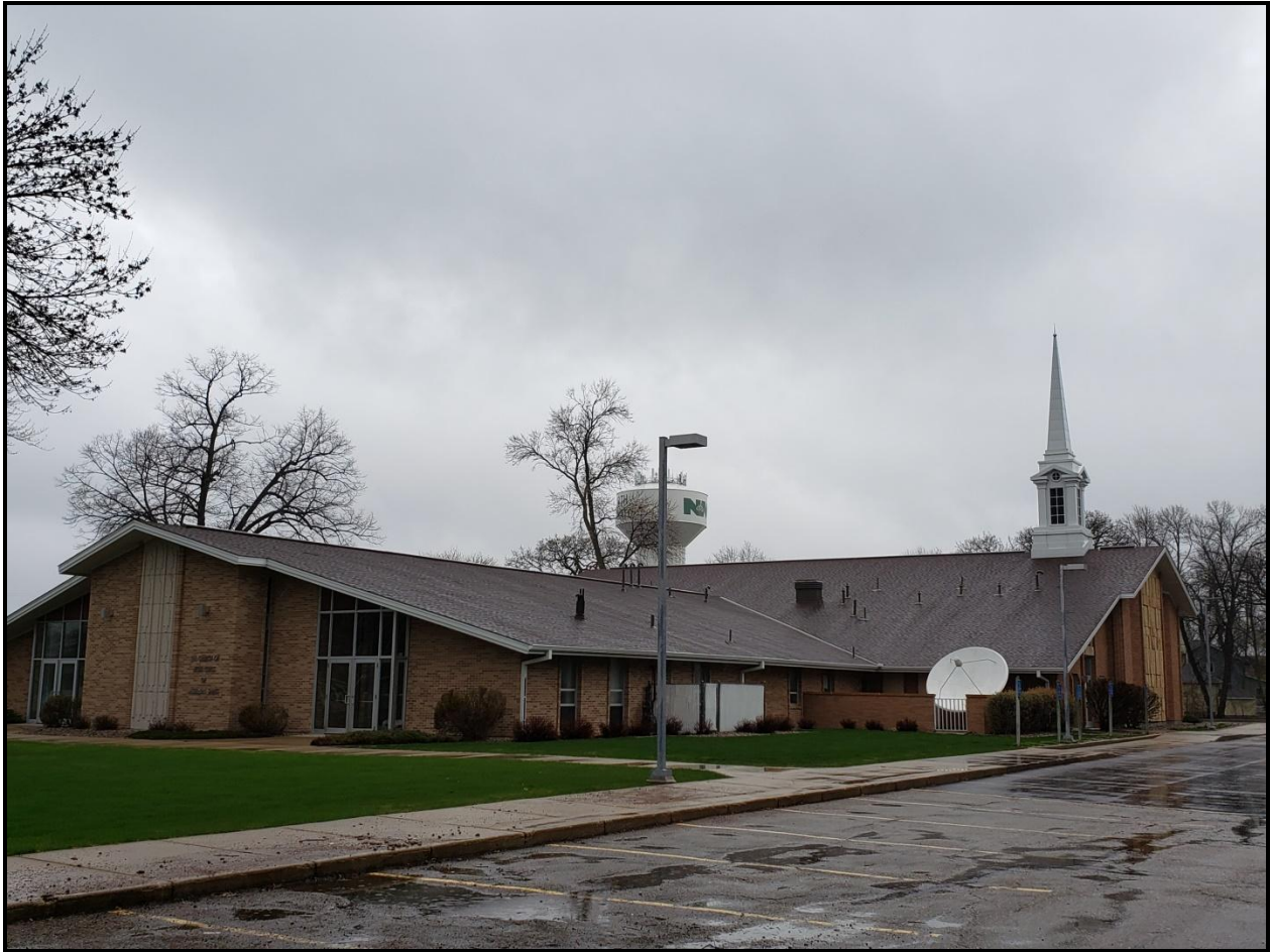
Mankato Minnesota Ward building