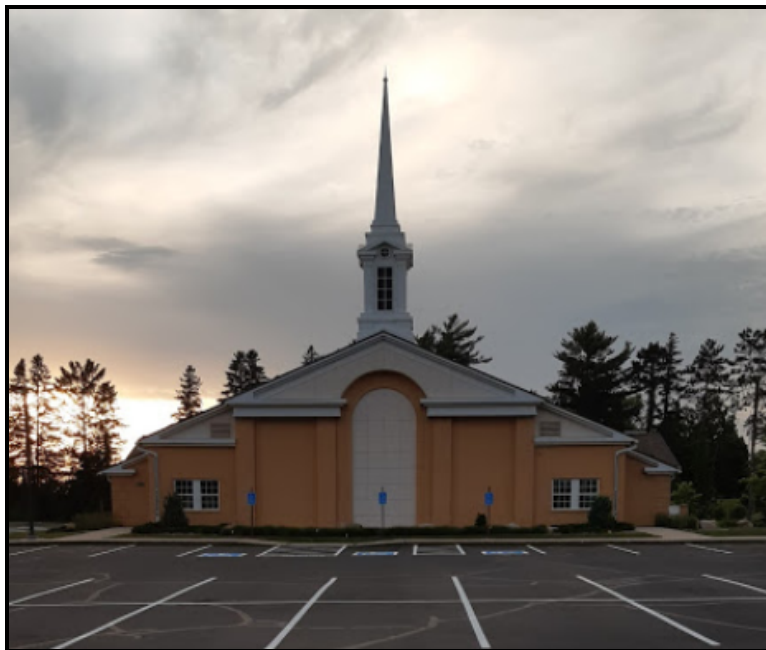
The Red Wing Minnesota chapel