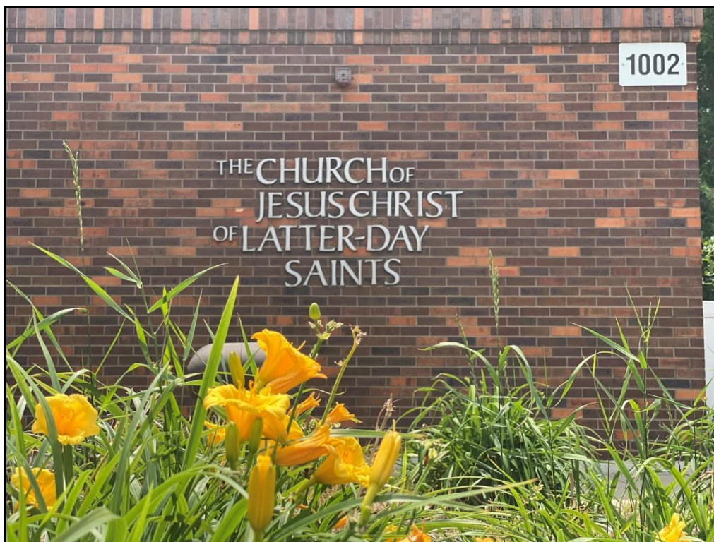
The Rochester Fifth Ward building on 6 th Street in Rochester, Minnesota