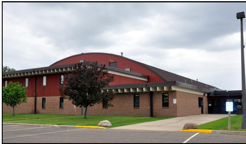
The Albert Lea ice arena, which was used for branch meetings

Once again, a branch was now located in Freeborn County. The Branch held their first meeting in the Albert Lea Minnesota ice arena on June 1, 1997.