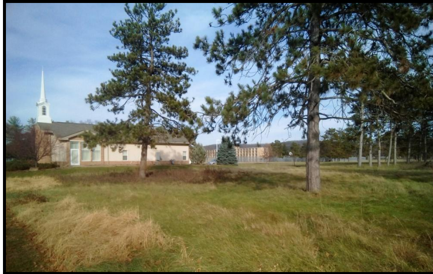
Prairie du Chien Wisconsin Branch building with the prison in the background