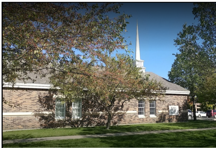
Fairmont Branch Chapel

At the April 2009 Rochester Stake Conference, it was announced that on May 3, the Fairmont Branch would become part of the Burnsville Minnesota Stake. As of this writing, this branch is still in operation and now is part of the Lakeville Minnesota Stake.