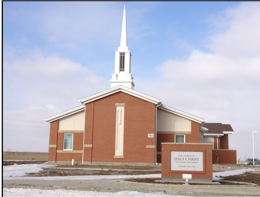
January 13, 2012, the Kasson Branch building