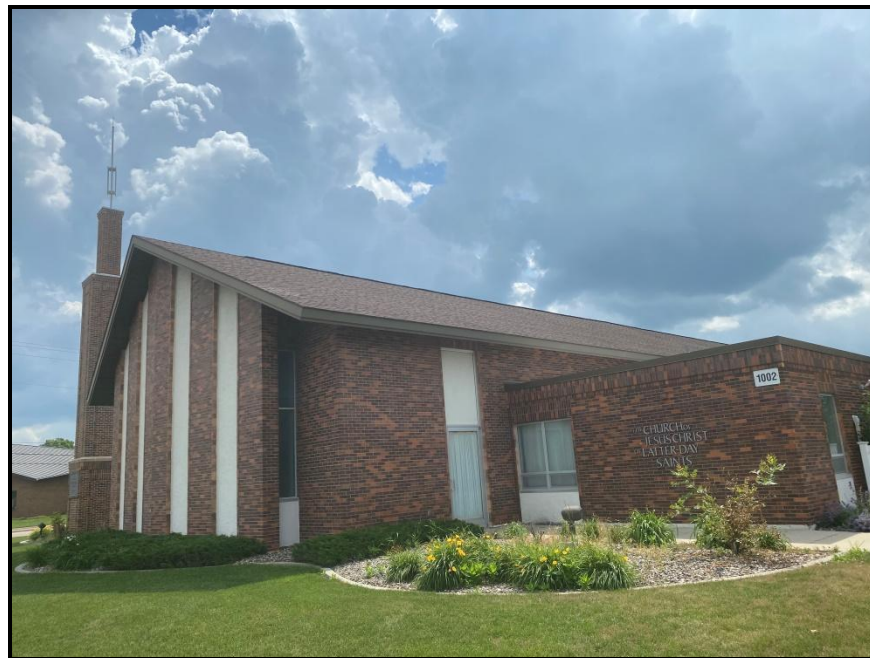
The Rochester Minnesota First Ward building