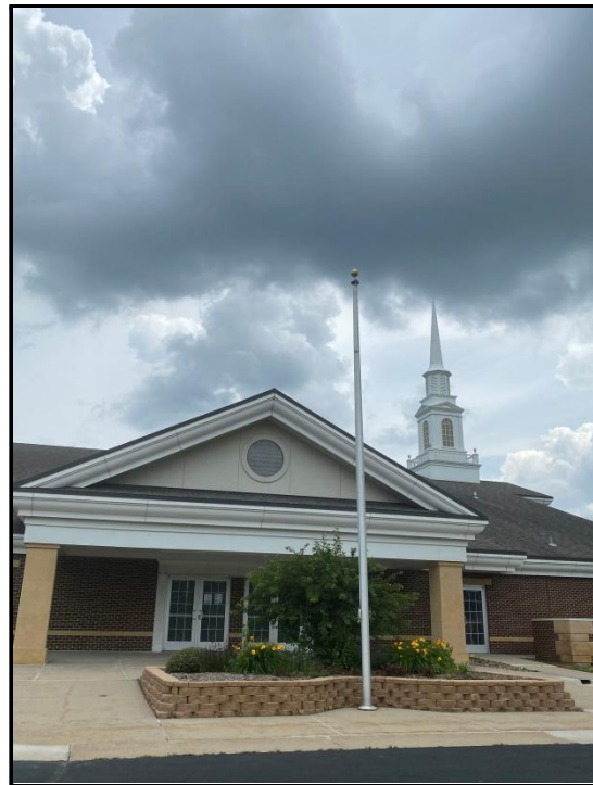
The Rochester Second Ward meets in the Stake Center