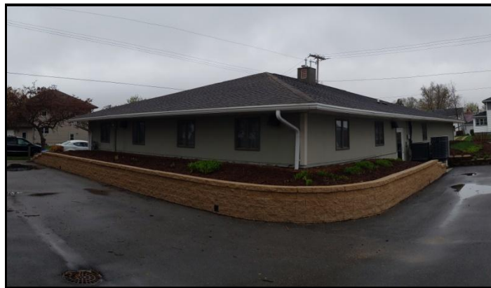
Back of Viroqua Wisconsin Branch meetinghouse