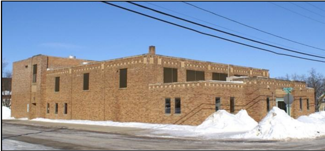
Dodge Center elementary school, where meetings were held from 1999-2003